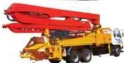
Boom Pump Concrete