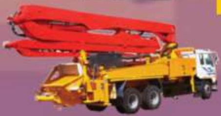
Boom Pump Concrete