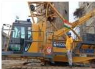
Aggcon has been investing in its heavy lift crane fleet, including this XCMG XLC250 crane.

He said, "The infrastructure equipment rental industry is contributing remarkably to India's infrastructure development".