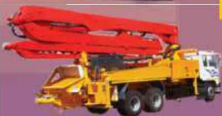
Boom Pump Concrete