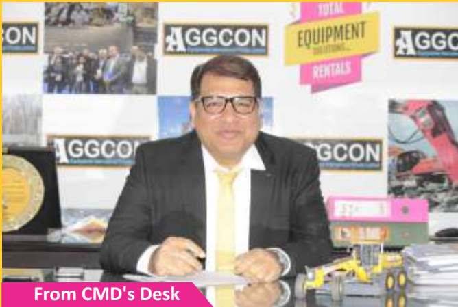
From CMD's Desk

Vol.01, Issue 01, January 2024-March 2024