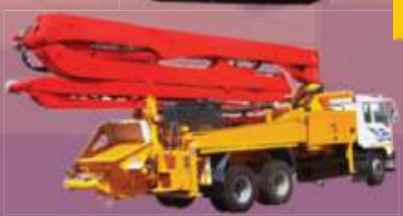
Boom Pump Concrete