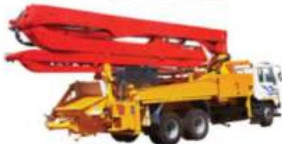
Boom Pump Concrete